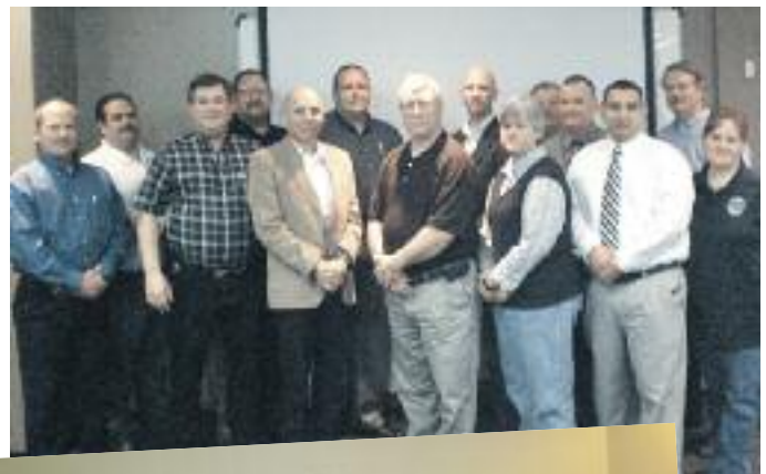
F.R.I.D.A.Y. Train-the-Trainer Class Graduates

For more information or assistance in locating an instructor, please contact any of the FRIDAY staff at 1-800-848-2088 x207 or by email at fridayinfo@tmpa.org . www.texasfriday.org